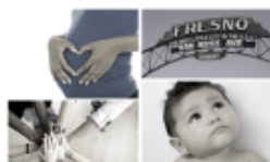
Fresno County Preterm Birth Collective Impact Initiative

Please RSVP at: https://worldprematuritydaywalk2016.eventbrite.com